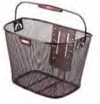
Front bike basket