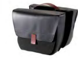
Double pannier bag